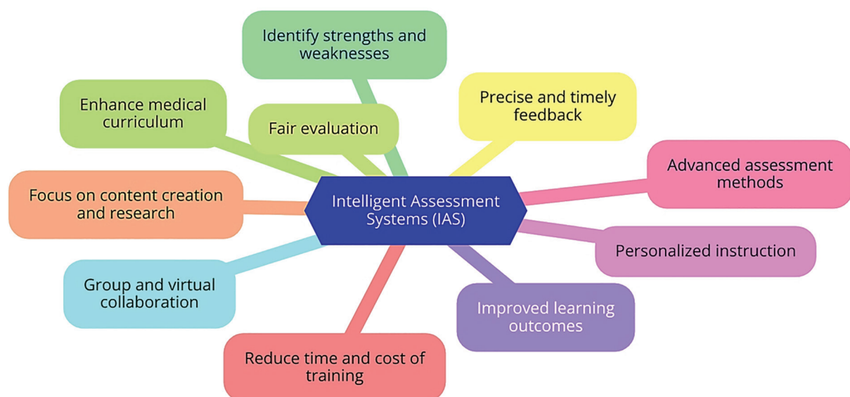
Figure 1: Mind Map of Key Concepts in Intelligent Assessment Systems (Authors' own work), Illustration of various benefits and applications of Intelligent Assessment Systems (IAS) in medical education

With the use of IAS, students can independently and automatically tackle various challenges in the field of medical sciences and compare their results with scientific standards. Additionally, by receiving regular and transparent feedback from IAS, students can identify their strengths and weaknesses and work on improving their performance (18-20).